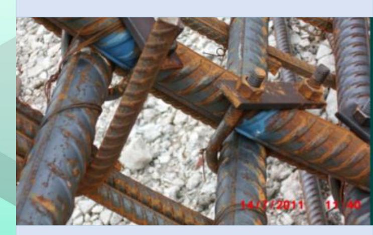
當用鐵線將鋼筋及金鋼圈定位後, 須立即用 U-碼上緊